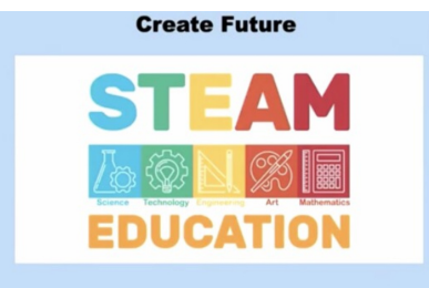
material used STEAM education workshop (from YouTube)