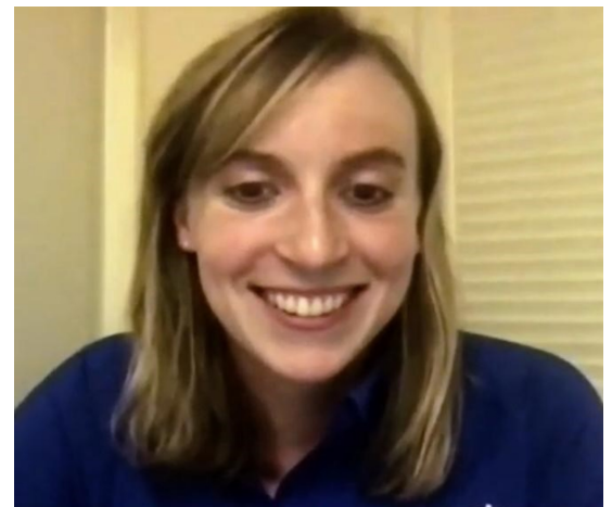
Katie Ledecky responded to our interview (from YouTube)

having a dream is important". Her answer was "It is really important to have a dream."